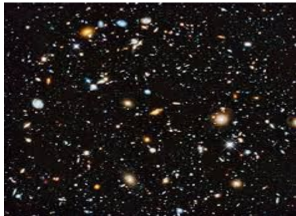
More than 10,000 galaxies in our local area...