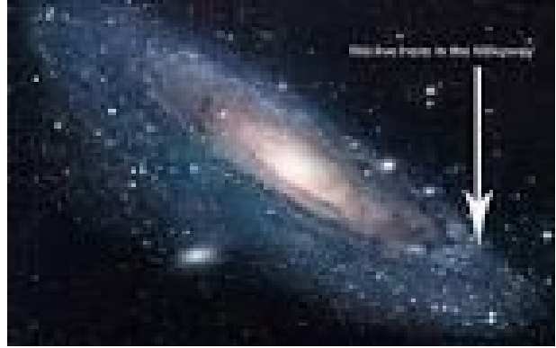
Our Milky Way Galaxy....400 billion stars!

I have asked numerous theologians, preachers for their idea of the future. Not necessarily about the Millennium or the rapture....but the very long term future! Where is earth in a million years time? Where is history and mankind heading? Is there still an earth. Are there a moon and stars? Does life go on in this universe?