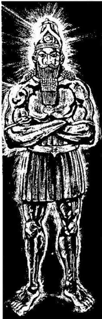
The Vision Daniel 2:31-33

"These great beasts, which are four, are four kings, which shall arise out of the earth. But the saints of the most High shall take the kingdom, and possess the kingdom for ever, even for ever and ever" (Daniel 7:17-18).